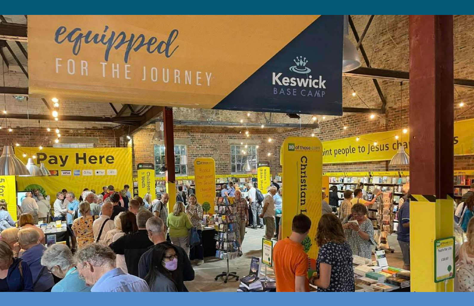
Week One: Saturday 15 July – Friday 21 July

Week Two: Saturday 22 July – Friday 28 July